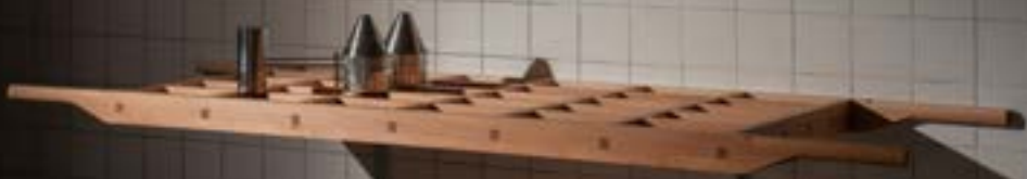
Waste Water Treatment Plant 1 , 2022, Sebastian Hedevang & Andreas Rønholt Schmidt. Wood, kitchenware, 210 x 80 x 40 cm.