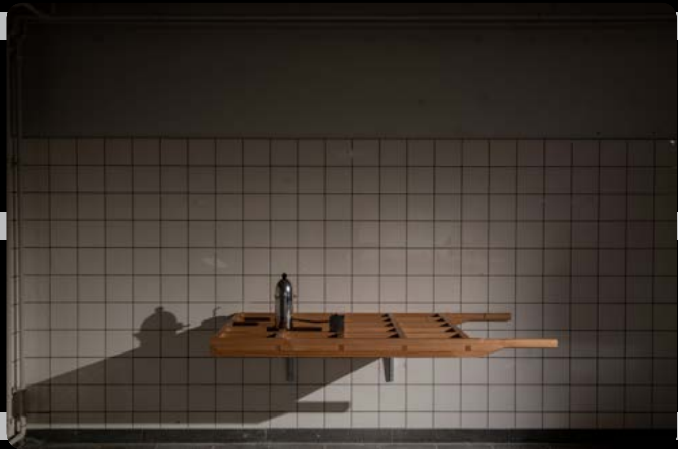
Waste Water Treatment Plant 2 , 2022, Sebastian Hedevang & Andreas Rønholt Schmidt. Wood, kitchenware, 160 x 80 x 40 cm.